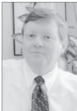
BY RUSS JONES

In my work, much of my time is spent with individuals who are not working and are seeking new career opportunities. Nearly all of them wish that they had paid more attention to their careers, family and friends while they had been working instead of hyper focusing on their jobs. As a result, they often make a personal pact to “do things differently” when they land a new position. Whether you are currently in the job market or contemplating a job change in the near future, some of the steps individuals plan to take after joining a new employer can be valuable planning tips: